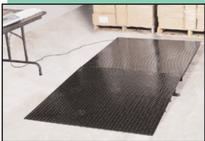
Shown here with optional approach ramp