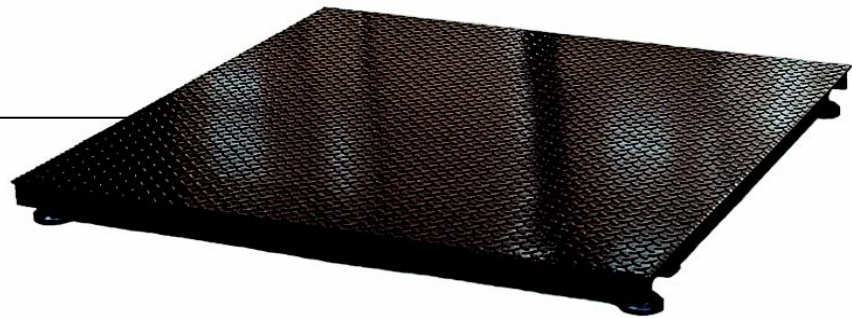
Guardian floor scale GRD 5544