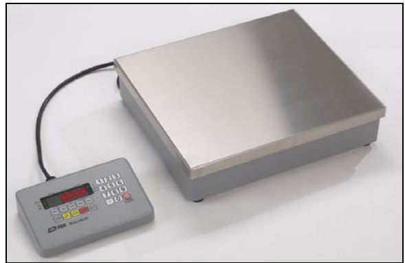
“Bullseye” counting scale with remote head Add $150.