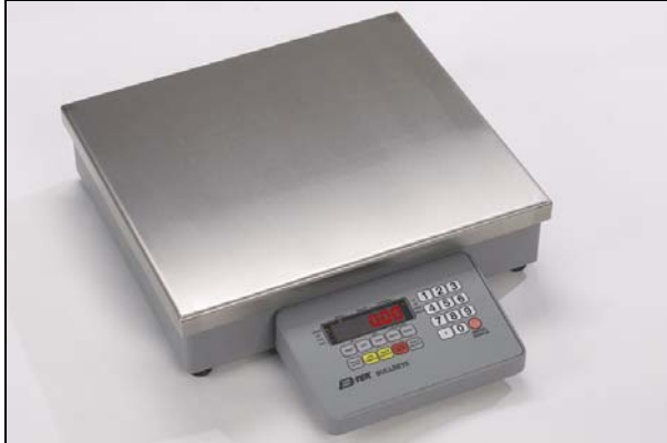
“Bullseye” counting scale