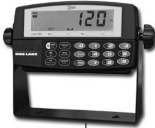
Model 120 plus C.O.C #03-059A1