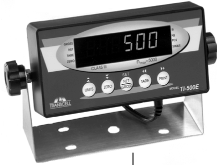
Model TI 500E C.O.C #94-080A2