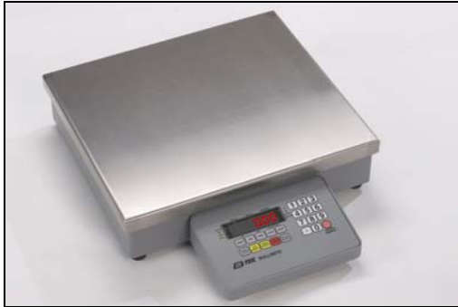
"Bullseye" Counting scale