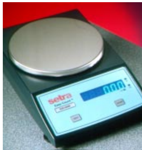
Model EZ2 Counting Scale

The EasyCount is even easier to use when bar coding receivables for future counting in the stock room, i.e., taking inventory or issuing to work-in-process. Simply connect the optional CoStar SETRA250 thermal label printer to the Easy Count and a touch of a button prints the average piece weight in bar code.