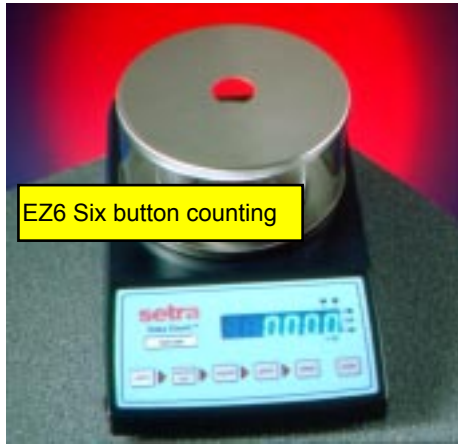
EZ6 Six button counting